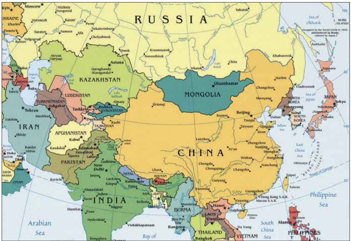
The geographical location where Russia, China, and the Indian Subcontinent meet, and where vast resources have remained under the mostly barren earth, has become the focus of the old British Empire-servers.

Equally important is the British plan to keep the Muslim nations in a state of permanent war. The British objective in the so-called Arab Spring was not to usher