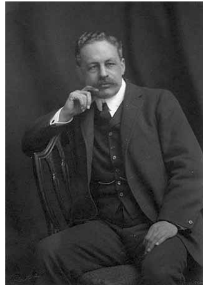
Halford Mackinder (1861-1947), the 20th-Century British geopolitician, coined the phrase “Pivot Region,” or “Heartland” (see map), pointing out that China, situated at the gates of this region, and with access to the sea, possessed sufficient human and natural resources to make a bid for Eurasian mastery sometime in the 20th Century.

Also, Russia is no longer under a Tsar or Bolshevik rule, and is part of a vast Eurasian landmass where the populous nations of China and India, among others, have begun to cooperate closely with Moscow. Moreover, China has emerged as the second-most-powerful nation in the world, economically and, perhaps, militarily. India is no longer under the British Raj, and is rebuilding its economy and infrastructure to become a