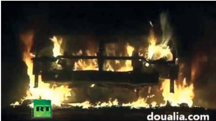
There is now incontrovertible evidence that the attack on the U.S. Embassy in Benghazi, Libya (shown here, following the Sept. 11 attack), which killed four Americans including the Ambassador, could have been prevented.

far, the President’s position has been to deny that the incident represented a second 9/11 attack, and to continue to promote the fiction that the overthrow of Qaddafi has led to a “democratic transition” in Libya. In fact, the unconstitutional U.S.-led overthrow of the Libyan government has already resulted in a spreading jihadi insurgency in other parts of Africa, starting in neighboring Mali, and extending all the way to Syria.