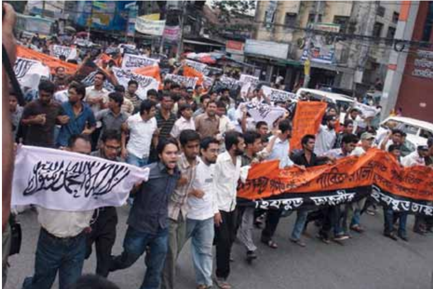
The banned terrorist group Hizb ut-Tahrir (HuT), based in London, calls for the establishment of an Islamic Caliphate throughout the Muslim world, and even beyond. Shown: a HuT demonstration in Dhaka, Bangladesh, January 2011.