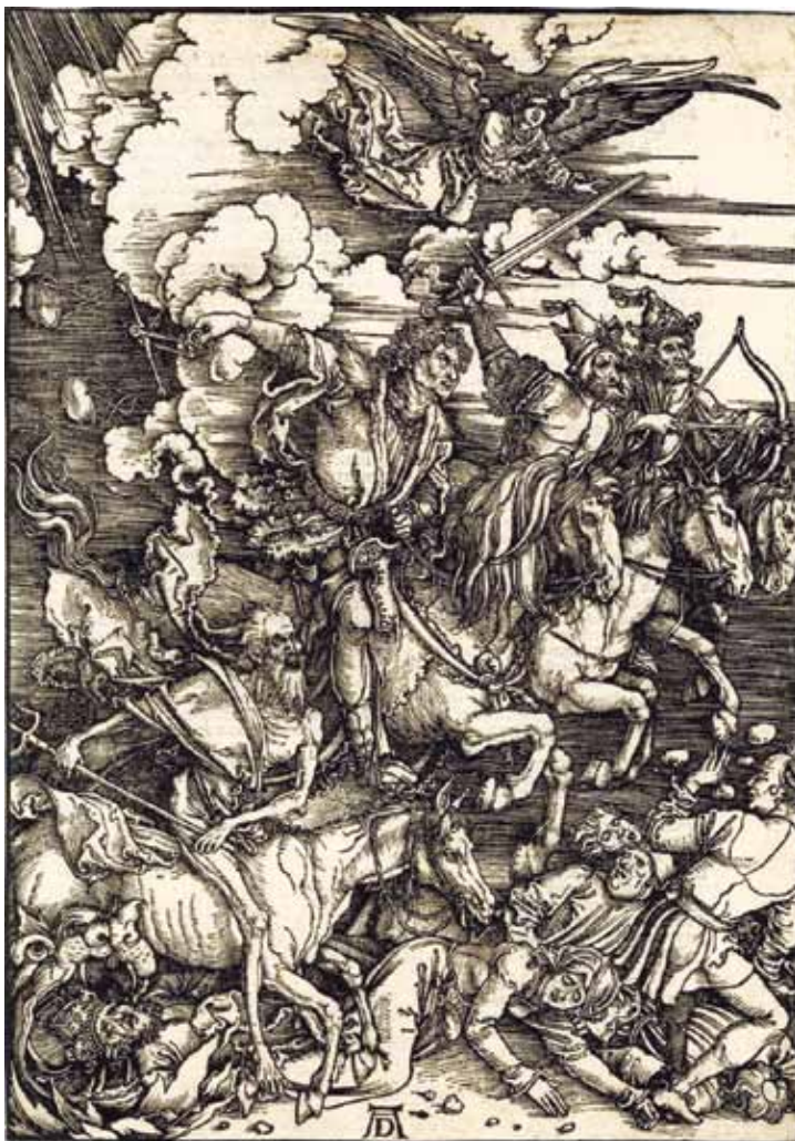
The oligarchical system, as far back as we know, has relied upon pestilence, famine, death, and war to cull the human population. Shown: "The Four Horsemen of the Apocalypse," by Albrecht Dürer (1497-98).

Today, on an almost daily basis we are fed a barrage of hysterical stories in the newspapers, on television, or Google News—complete with such appropriately lurid headlines as, "Earth Near the Breaking Point" and "Population Explosion Continues Unabated"—predicting the imminent starvation of millions because population is outstripping the food supply. We regularly hear that, because of population growth, we are rapidly depleting our resource base, with catastrophic consequences, such as war and genocide, looming in our immediate future. We are repeatedly told that we