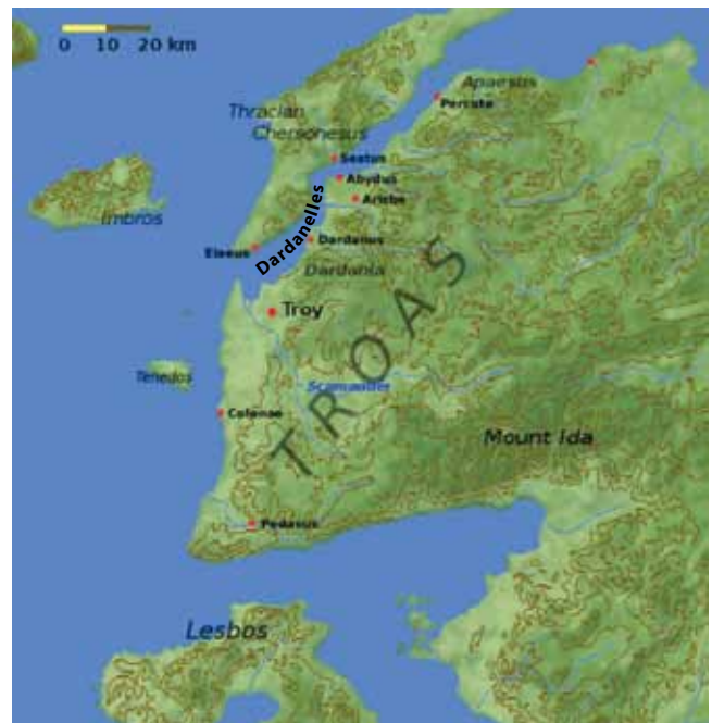
FIGURE 1 Ancient Troy

Troy's citadel overlooked the Dardanelles, giving the city control over East-West trade and commerce.