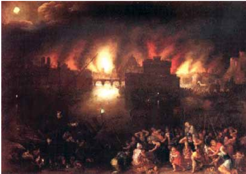
In the Iliad , Agamemnon tells his brother Menelaus, “We are not going to leave a single one of them [the Trojans] alive...” Shown: “The Burning of Troy,” by Jan Bruegel the Elder (1621).

Zeus, as an ancient precursor to today’s “Green Movement,” desires to relieve the overburdened Earth of carrying too many people. In the third fragment of the Cypria we learn that: