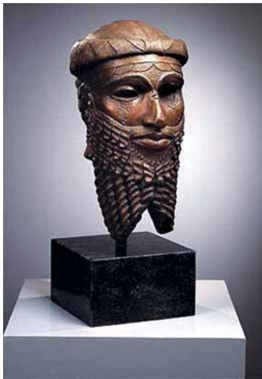
National Museum of Iraq

At present the population of the world is increasing at about 58,000 per diem. War, so far, has had no very great effect on this increase . . . but perhaps bacteriological war may prove effective. If a Black Death could spread throughout the world once in every generation, survivors could procreate freely without making the world too full. There would be nothing in this to offend the conscience of the devout or to restrain the ambition of nationalists. The state of affairs might be somewhat unpleasant, but what of it? Really high-minded people are indifferent to happiness, especially other people’s. 7