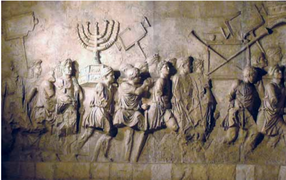
In the first Roman war against the Jews (66-73 A.D.), the city of Jerusalem was burned, and all its people killed or enslaved. This detail of a relief from the Arch of Titus in Rome, depicts the looting of the Temple by Roman soldiers.

Republic and Empire combined killed almost 6 million people in wars, executions, and slave revolts. 20 Below are estimates of some of these casualties. These do not include the millions killed in the games, smaller military pacification operations throughout Europe, North Africa, and the Middle East, nor outright genocide.