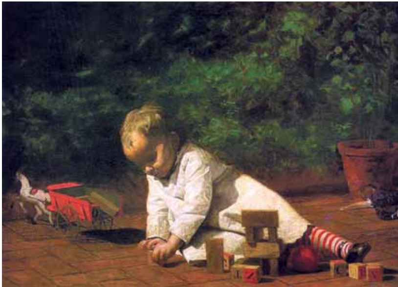
"Mankind is the only species presently known to us which is capable of being defined, precisely, as of the potential quality for voluntary self-evolution of the human species." Shown: "Baby at Play," Thomas Eakins (1876).

entific practice sufficient for providing mankind's growing "intellectual" form of capacity for managing those extended operations pointing to the ability for deliberate development of intellectual powers capable of a blending of direct and indirect operations functioning ultimately on a Solar-systemic scale, this by taking into account the possible case ultimately without the "outer limits" known to us presently.