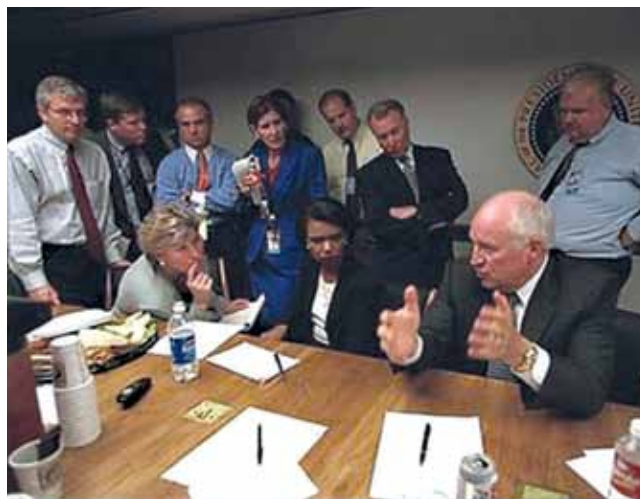
Vice President Dick Cheney, National Security Advisor Condoleezza Rice, and senior staff immediately after the 9/11 attacks. The coverup begins.

And, it wasn’t just the State Department that gave