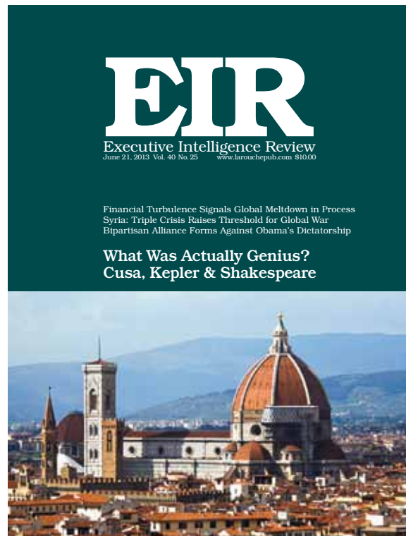
LaRouche's article "What Was Actually Genius? Nicholas of Cusa, Kepler & Shakespeare" appeared in EIR , June 21, 2013.

by some; however, to enable human beings on Earth to recognize the implications of that fact, we require a measure urgently needed for building up a much-needed escape of the population from the fraud inherent in the notion of Earth-bound sense-certainty.