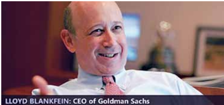
Goldman Sachs and CEO Lloyd Blankfein were leaders in the criminal syndicate that bilked millions from U.S. cities, using the Libor scam, and other forms of “creative” looting.

jobs overall, even as enrollment rises by 83,000 students per year. Schools have been closed across the state, with poor children losing access to free lunches.