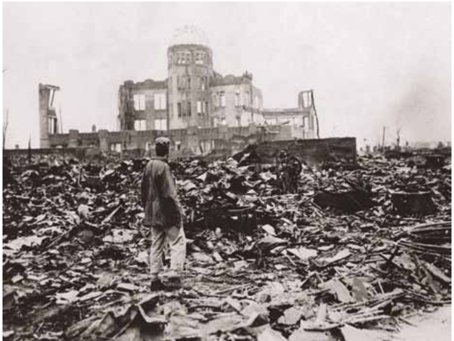
Only the combination of leading powers, such as the U.S.A., Russia, China, and perhaps others, could check the British imperial willingness to set off a global thermonuclear holocaust, LaRouche writes. Shown is Hiroshima after the nuclear bombing in 1945; after a thermonuclear war, life on Earth might not continue to exist at all.

Thus, to summarize the point of fact immediately here, the continuation of that original September 11, 2001 (“9-11”) attack on the U.S.A., by the same leading, Anglo-Saudi institutions, has had a continually increasing impact among the targeted populations of a now rapidly growing rate of looting of nations. In the meantime, there has been a persistently accelerated rate of a currently downward trend present in most conditions of human life within the planet at large, a “super-crime” which is now the currently, openly declared intention of the British monarchy. This is a threat which is now intended, explicitly, as stated by the present Queen of England herself, to become the source of a currently measurable collapse in the population, that from a former level of about seven billions for the world population, to the stated, intended, early, present Brit-