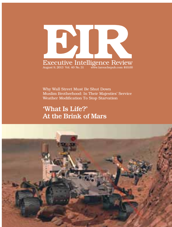
LaRouche's "At the Brink of Mars" appeared in EIR , Aug. 9, 2013. The present document picks up where that one left off.

Should my herein-stated concerns be heeded, the long-ranging prospects for policy-shaping of our planet and its peoples, lie along the course of an orientation toward the long-term cooperation of the Earth with the planet Mars. I do not mean any immediate attempt to colonize Mars with a human population. That would be worse than a futile folly for the early generations of this presently still-young century; a longer-term, "practical" association of the two planets, as planets, one, Mars, to be engaged in a pro-human set of developments steered from, the other, Earth is needed, instead. Any present prospects for mankind's development of