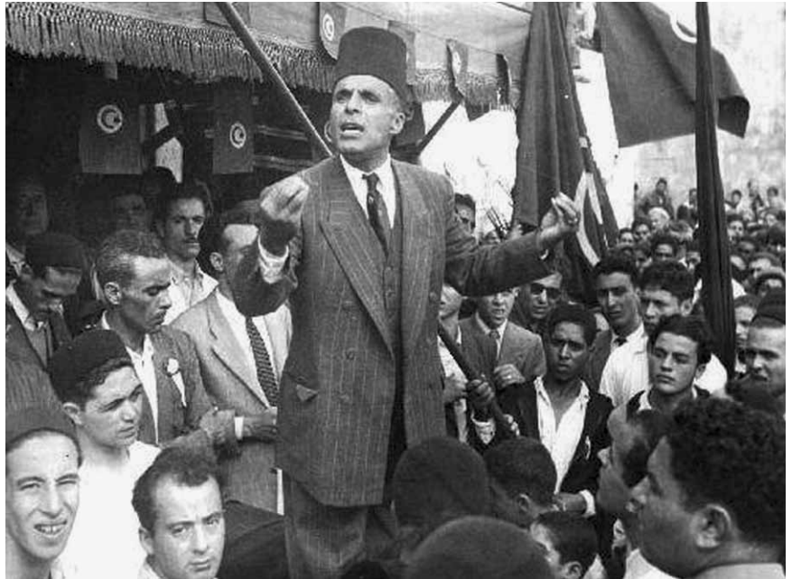
President Habib Bourguiba (1957-87), who promoted economic development and agricultural subsidies, was overthrown in a coup led by Ben Ali, in league with the Brotherhood and the IMF.

Ben Ali's ouster was sought by the Tunisians to change the country's economic direction. However, the Muslim Brotherhood saw in it an opportunity to grab and consolidate power. Economic issues were not on its radar screen and, anyway, it had already made itself dependent on the IMF. As a result, the post-Ben Ali period failed to bring economic relief to the Tunisians. While it was evident that Tunisia's economic condition could not be quickly turned around, it was expected that the Brothers, who were brought to power by the people protesting their rip-off at the hands of the Ben Ali clan/IMF, would make an effort to carry out economic reforms over time.