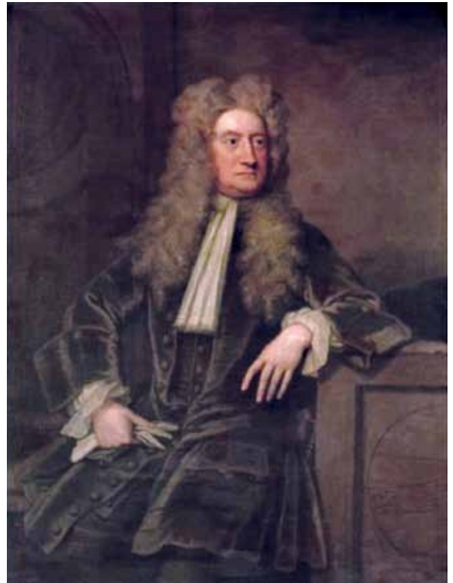
Isaac Newton’s influence “is far worse than silly dogma; it has been, probably, the greatest maker of fools among the body of even relatively many certified scientists, up to the present time,” LaRouche writes. Painting by Sir Godfrey Kneller.

On this account of fact, since the time of the assassination of President John F. Kennedy, there have been a few noteworthy U.S. Presidents, such as the President Ronald Reagan who supported, notably, the initiative for a Strategic Defense Initiative (SDI) , and with an added consideration for the possibility of a near-echo of something not-dissimilar during President Bill Clinton’s actual term in office—the whole tribe of familiar Bushes echoes the deeply-rooted, treasonously fascist outlook of the late Adolf Hitler crony Prescott Bush. It is essential to bring the nation out of the Bushes.