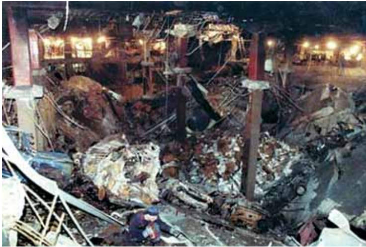
Bureau of ATF

The 1993 bombing of the World Trade Center left this damage underground. Some people in the FBI knew about the bomb plot in advance—in fact, they had recruited agents to drive the van that carried the bomb, among other things.