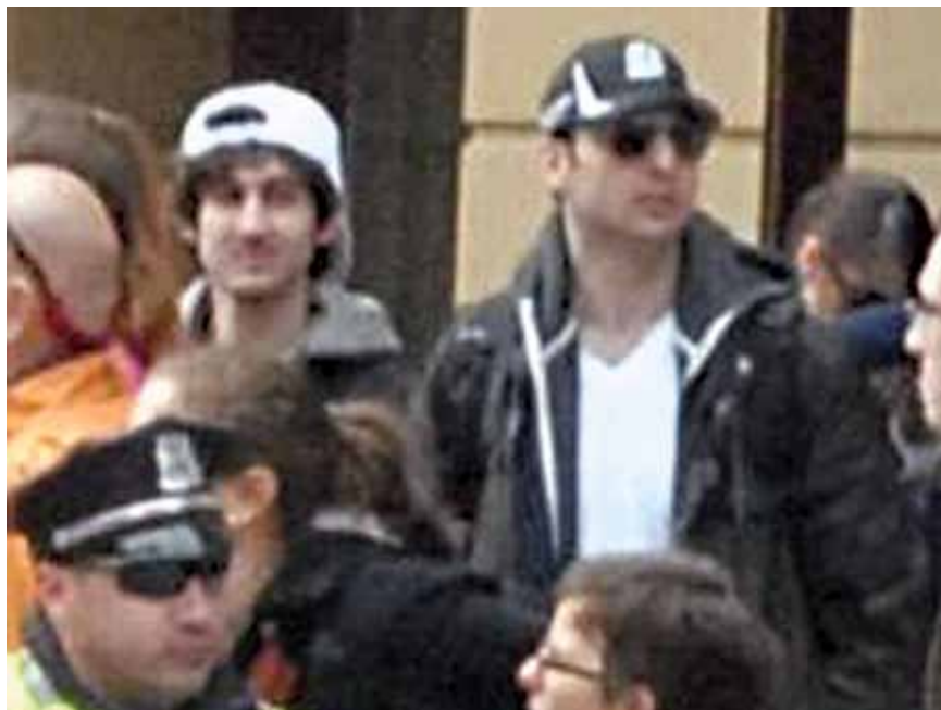
The FBI is carefully orchestrating what is released to the public about the alleged Boston Marathon bombers (shown here). Fox TV's Ben Swann asked: "Is the practice of the FBI creating terror plots only to break them up before they can actually happen, really making us safer? What happened here?"

"were almost entirely concocted and engineered by the FBI itself, using corrupt agents provocateurs who often posed a far more serious criminal threat than the dimwitted saps the investigations ultimately netted."