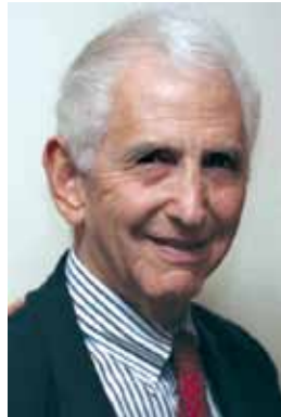
Daniel Ellsberg, VIPS Member Emeritus

The options your letter addressed regarding potential use of military force included five being considered at the time: (1) Train, Advise, Assist the Opposition; (2) Conduct Limited Stand-off Strikes; (3) Establish a No-Fly Zone; (4) Establish Buffer Zones; (5) Control Chemical Weapons. You were quite candid about the risks and costs attached to each of the five options, and stressed the difficulty of staying out of the Syrian civil war, once the U.S. launched military action.