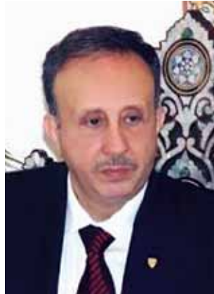
MHD. Jihad al-Lahham, the Speaker of the People's Assembly of Syria

Yours faithfully, Speaker of People's Assembly MHD. Jihad AL-LAHHAM