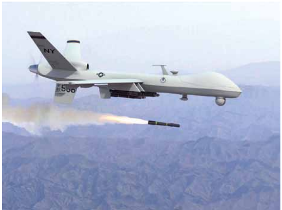
A predator drone firing a missile. Will the Obama Administration come up on charges of war crimes, for the indiscriminate killing of civilians?

The White House responded to these two reports, in the person of spokesman Jay Carney, who told reporters on Oct. 23 that “U.S. counterterrorism operations are precise, they are lawful and they are effective,” and that the United States takes “extraordinary care” to avoid civilian casualties, but this is war, and in war civilians get killed.