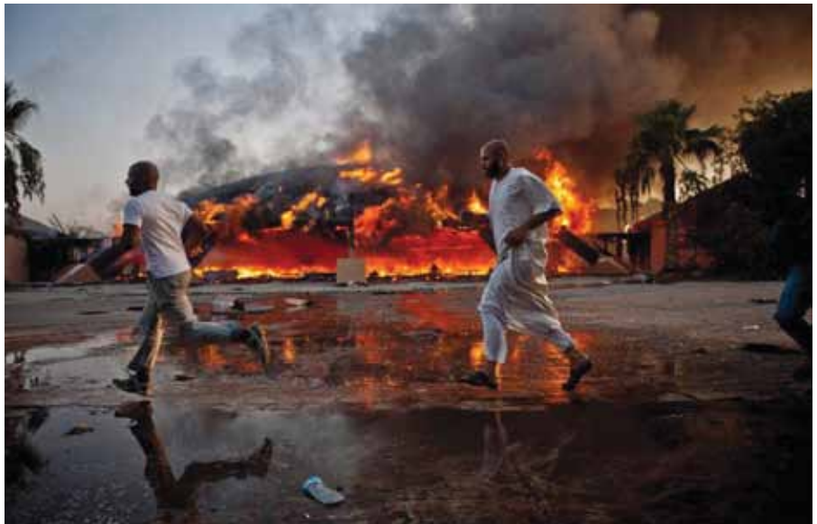
Murdered Libyan leader Muammar Qaddafi’s tent in Tripoli burns, Aug. 24, 2011. The U.S. war against Libya was unconstitutional, conducted without approval of Congress.

However, the authors stick too closely to a Republican electoral story line in arguing that U.S. Ambassador Christopher Stevens went to Benghazi at the urging of Secretary of State Hillary Clinton in order to turn the mission there into a permanent post, and that the talking points given to then-UN Ambassador Susan Rice, which omitted reference to al-Qaeda’s involvement in the attack, and falsely claimed that the attack was a protest over an anti-Muslim video, were designed to “protect the State Department.”