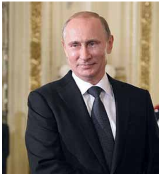
Presidential Press and Information Office Russian President Vladimir Putin

The bank and the Currency Pool, with combined resources of $200 billion, lay the foundation for coordinating a macro-economic policy between our nations.