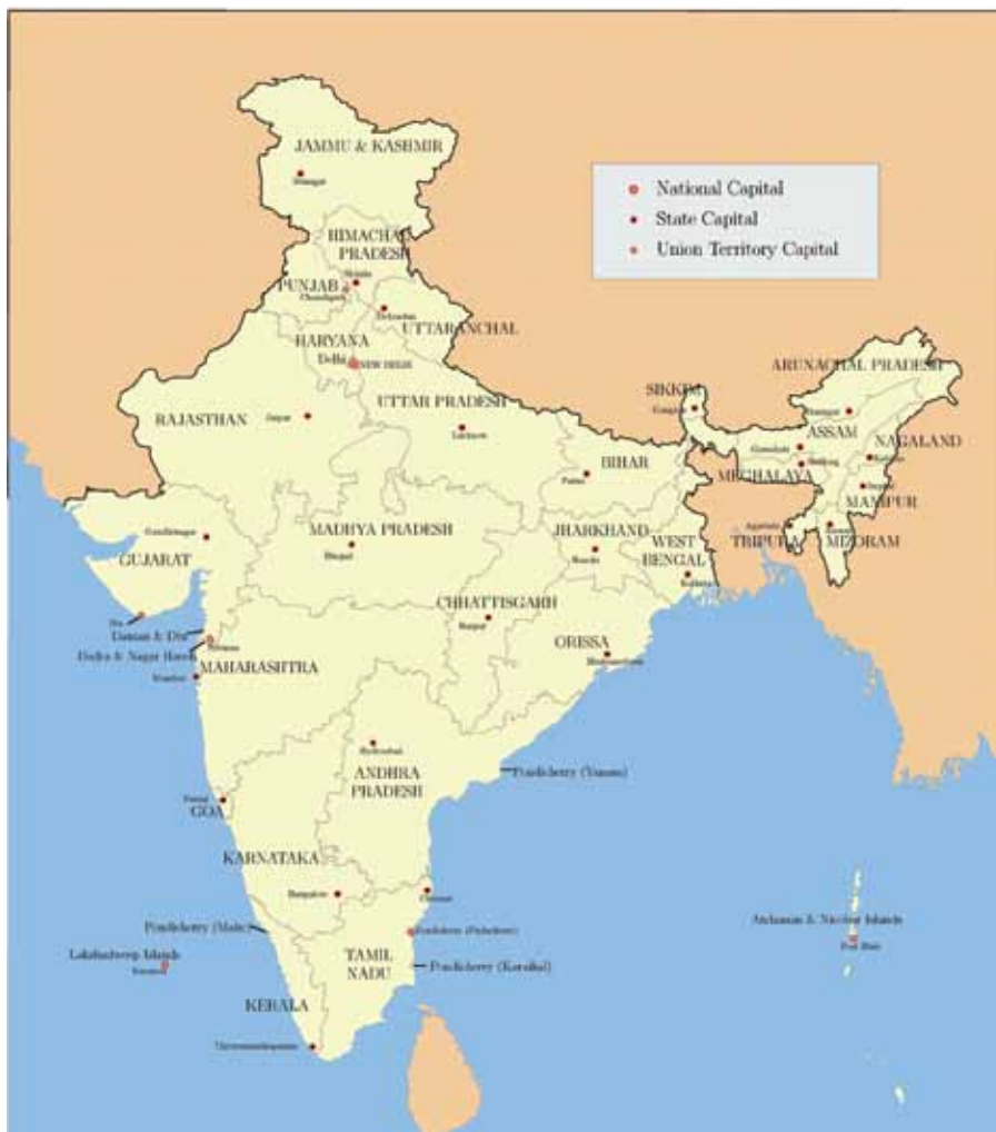
FIGURE 1 India's States and Union Territories