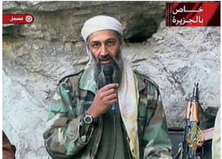
Osama bin Laden was recruited by Prince Turki to become a jihadi and to use his substantial financial resources to set up the Maktab al-Khidamat network, which became al-Qaeda.

“In 1979 Usama Bin Ladin went to Prince Turki for advice after he became infuriated by the Soviet invasion of Afghanistan. Following Prince Turki’s sugges-