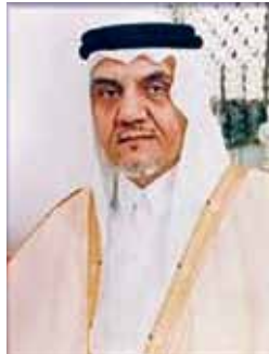
Charles' closest collaborators among the Saudi royals are Prince Turki bin Faisal (left), Prince Bandar bin Sultan, (center), and Prince Mohammed bin Faisal. All are key in the British-Saudi-al-Qaeda nexus.