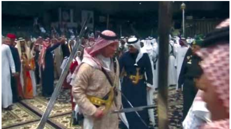
Prince Charles of Arabia, shown here in Riyadh with his close friends in the Saudi royal family, joining in the ritual "Sword Dance," based on ancient Bedouin traditions.

These two additional features will be presented in two parts, beginning with this article documenting the close relationship of Prince Charles, as the designated