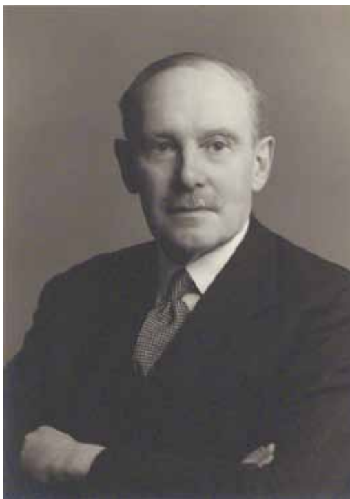
National Portrait Gallery, London

MI6 was in lockstep with the imperial army. In late Summer that year, MI6 chief Menzies created the infamous Section 9 of the agency, which was tasked to track international Communist activities, a counter-espionage unit. The unit, one of the most important at MI6, was headed up by the Soviet/British master spy Harold "Kim" Philby. Whatever MI6 discovered was also