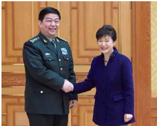
Republic of Korea, Office of the President

On Feb. 4, Chinese Defense Minister Chang Wanquan, after meeting with South Korean Defense Minister Han Min-goo in Seoul, said publicly (for the first time by a Chinese official) that the U.S. intention to place THAAD (Terminal High-Altitude Area Defense) missiles in South Korea was viewed as a direct threat to China—just as the U.S. placement of missile defense systems along the Russian border in Europe is recognized in Moscow as a threat to launch a first strike nuclear attack, despite claims from Washington that they are only intended to defend against Iran's (non-existent) missile threat. Chinese Foreign Ministry spokesman Hong Lei reiterated the concern the next day, saying that “countries should bear in mind the security interest of other countries as well as regional peace and stability in the pursuit of its own security.”