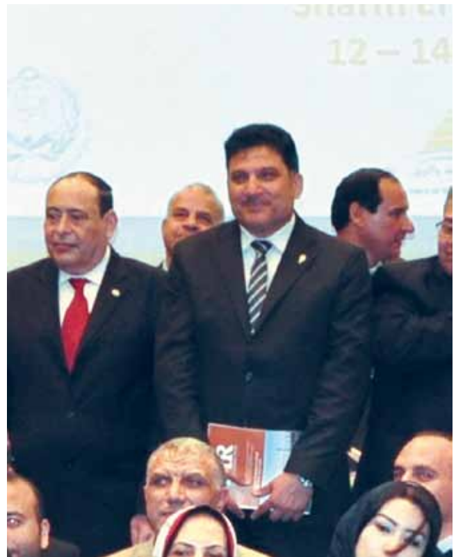
Egyptian Minister of Water Resources and Irrigation Dr. Husam Mughazi, at the International Water Technology Conference, with his copy of EIR in his hands.

The major risk is that the whole new capital city project could become a real estate bubble, with astronomical prices that could not be afforded by ordinary citizens, or even by Egyptian companies and their employees. Although Minister Madbouli claimed that the government would provide housing for hundreds of thousands of low-income Egyptians, what this project