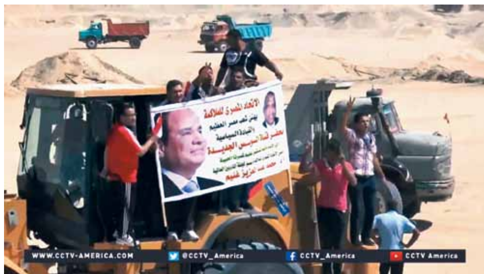
"Euphoric" Egyptians working on the new Suez Canal, give the V for Victory sign, while hoisting a banner picturing President El-Sisi.

There are, of course, big questions that have not been answered by El-Sisi's government. The major