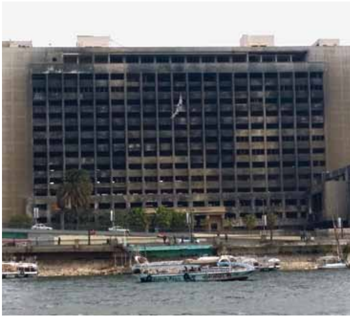
The burned-out building that formerly housed ex-President Hosni Mubarak's party headquarters is left as a reminder that the Egyptian people will not tolerate corrupt governments.

George W. Bush Administration, has continued and spread the regime-change policy, which the Egyptian people see spreading fires all around them, from Libya to Syria and Iraq. They regard the Obama Administration and its partners in Qatar and Turkey as the source of domestic terrorism, which intends to divide and destroy the nation when their “agents” of the Muslim Brotherhood failed to do that, or were prevented from doing that by the Egyptian people’s massive turnout in the June 30, 2013 revolt against Morsi, and the massive turnout in the Presidential elections last year, which brought El-Sisi to power by an overwhelming majority.