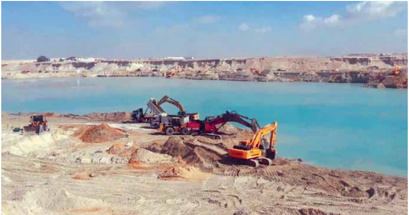
The new Suez Canal project is currently underway. It will include not just the canal, but new ports, railways, and industry.

Besides the political price, the Gulf States expect to be given a huge share of the contracts for real estate, agriculture, and power, with preferential terms and conditions, which will allow them to earn more than they have spent and to achieve a dominating position in Egypt's economic future. If the Egyptian authorities are not alert to the corrupting effect of allowing these special practices, the country could easily slide back to Mubarak's era of corruption and mismanagement.