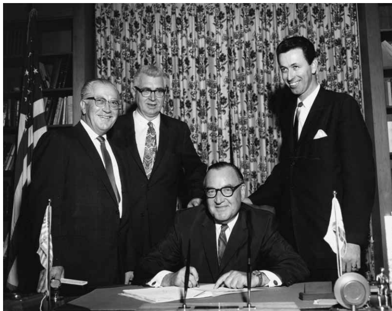
Gov. "Pat" Brown (1959-67), an FDR Democrat, vowed that he would build the largest infrastructure project ever attempted in a single state in U.S. history. And he delivered.

In high school, Pat Brown had organized his own fraternity, because the main fraternity excluded Jews (Brown was a Catholic). As San Francisco's District Attorney in the 1940s, he urged the adoption of laws to ban racial discrimination in housing. Later, as Califor-