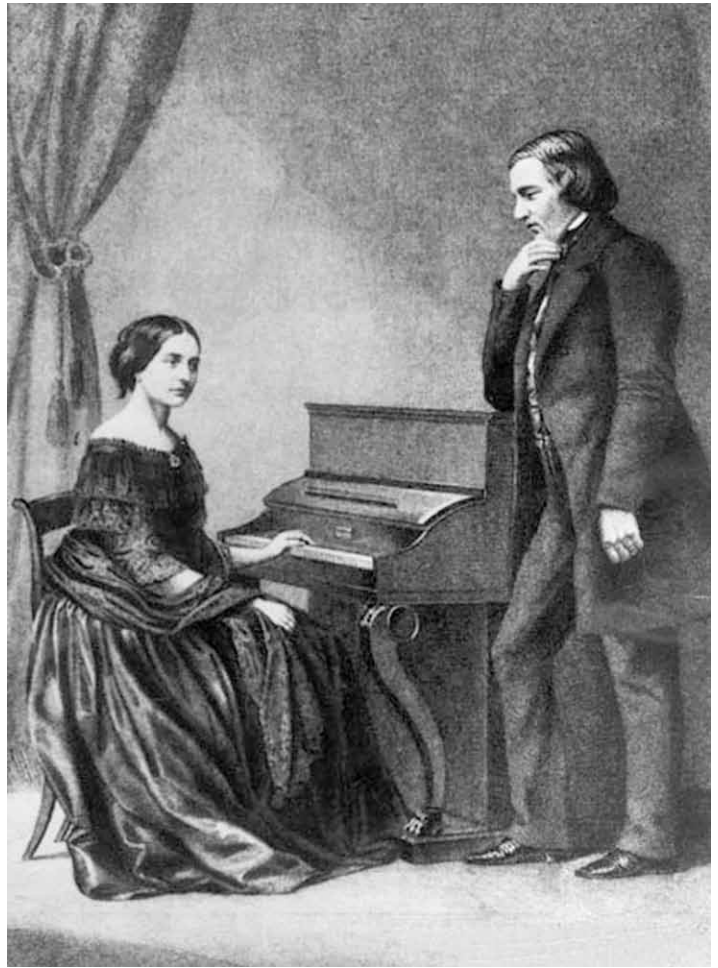
"Whoever does not know his Symphony knows little of Schubert himself," stated composer Robert Schumann, who discovered the symphony in 1837. Here, Schumann with his wife and fellow artist Clara Wieck Schumann.

Creativity occurs within the sovereign recesses of the individual human mind; as valuable as known ideas may be, creativity does not exist in dogmatic repetition of formulas, a distinction to which Schumann was committed without compromise. Yet,—and it seems to be a paradox,—true creativity is intensely "social," or