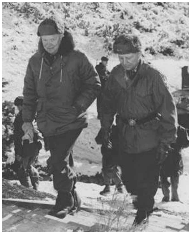
President-elect Dwight D. Eisenhower (left) during his visit to Korea in December 1952.

Eisenhower had a secret, or not-so-secret, weapon not only to end Korean War, but to reestablish trust between the United States and the Soviet Union. That secret weapon was his old commander and war time collaborator, General Douglas MacArthur, for whom Eisenhower served as chief deputy for almost ten years