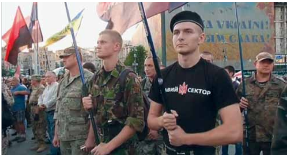
FLASHPOINT: Ukrainian fascist groups which have been supported by Obama and NATO, rally against President Poroshenko on July 22, 2015, demanding a more aggressive policy against Russia.

If Obama is able to maintain control over the policies of the United States, during the period of this month, then the doom of most of our nation, and most of the planet will go down with it. That is what must be prevented, and that is what I'm dedicated to prompt the people who should know better, to know better, and to do the things to get Obama thrown out of office, and to realize a great peace.