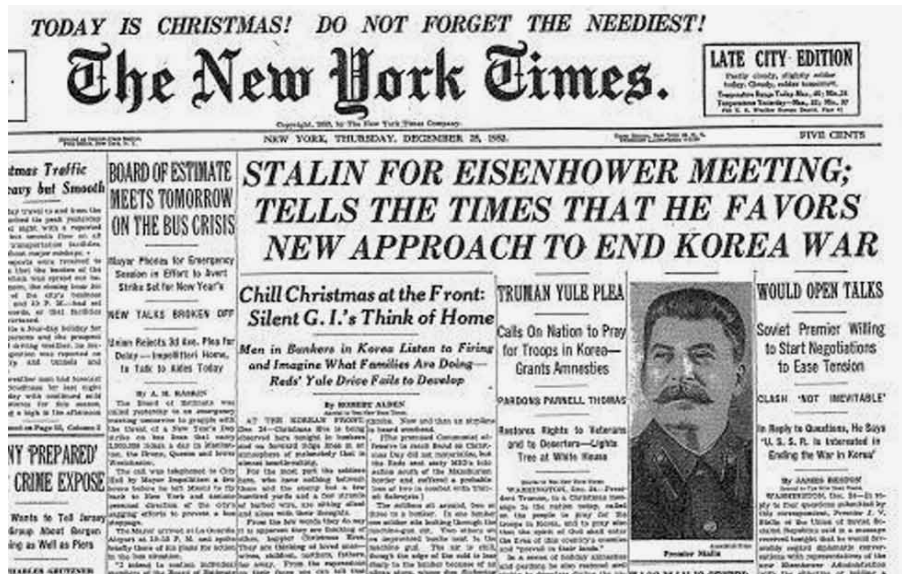
The New York Times' Christmas Day 1952 interview with Josef Stalin, in which Stalin welcomes the idea of a meeting with Eisenhower. The British were apoplectic.

Nonetheless the Korean Armistice was signed on July 27, 1953. The Austrian peace treaty and subsequent removal of all foreign troops and its neutralization did not occur until May 15, 1955.