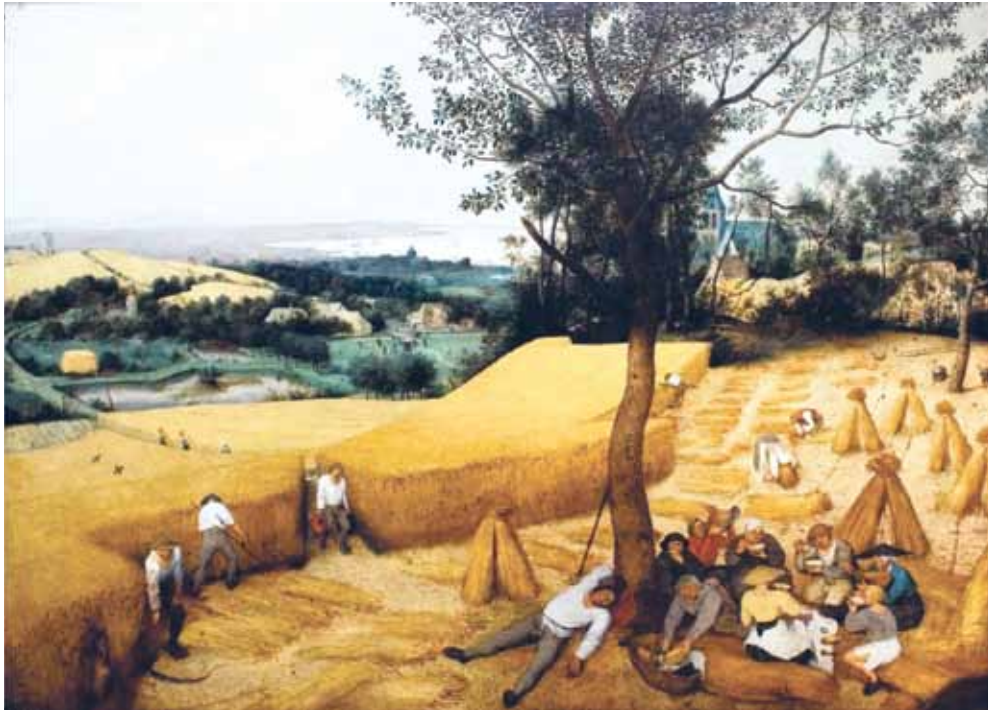
"The Harvesters" by Netherlandish Renaissance painter Pieter Bruegel the Elder, in which he depicts the August-September season, c. 1565.

For example, in the Congress: In the Congress in general, that's the standard. There's no sense of reality. There's no sense that there's a threat of the extermination of the human species. When everything is there, on the table, right now, for the extermination of the human species. The weapons of war needed to exterminate the human species, already exist, and are essentially in play, on the edge of being applied. And we do nothing!