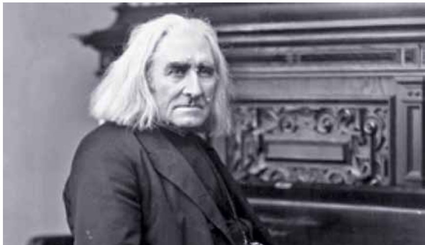
Franz Liszt (1811-1886) at the piano in the year of his death, 1886.

and things like that, but that's not the answer. The answer is, what is the principle which makes a composition, of music, for example, what makes it beautiful? and what otherwise is not beautiful? And that is the placement of the tone which is between the notes; not on the notes, between the notes. And the fact that the orchestration of performance lies between the notes rather than on the notes. [See footnote 2]