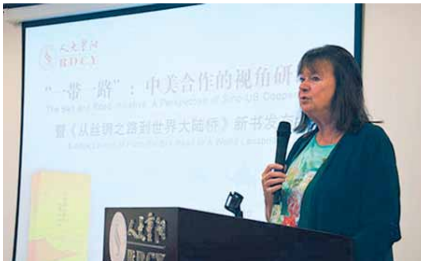
Helga Zepp-LaRouche speaks at the symposium on “The Belt and Road Initiative of Sino-U.S. Cooperation” & Book Launch of From a Silk Road to a World Land-Bridge held in Beijing on Sept. 29.

In her address to the symposium, Mrs. LaRouche explained her role in the germination of the idea known in China as the “One Belt, One Road” project. She explained how she and her husband, economist and statesman Lyndon LaRouche, had, with the breakup of the Soviet Union, expanded on the series of development programs they had worked on for decades,