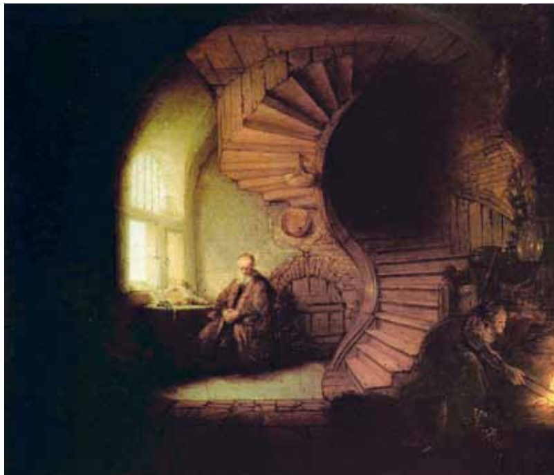
Philosopher in Meditation, painted by Rembrandt in 1632. Just where does the hypothesis come from?

When you take creativity out, in a very precise way—not just any arbitrary innovation—because what LaRouche did in his physical economics, and that's what I think we mean by reality here, what LaRouche demonstrated is that the human species depends on creativity—that is, progress in our knowledge of the Universe. That's what makes us unique as a species. We evolve ourselves through the creative development of our relationship to the Universe in the form of knowledge that gets us deeper into the Universe. But that's necessary to human existence. It gives meaning to human life.