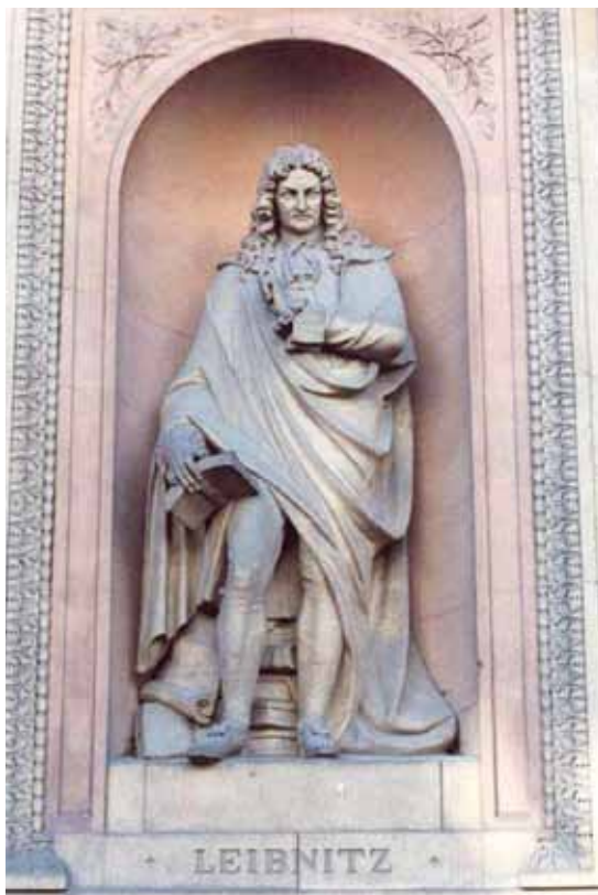
One of Bertrand Russell's arch-enemies, German scientist and philosopher Gottfried Leibniz, shown in his statue on the exterior of the Royal Academy of Arts in London.