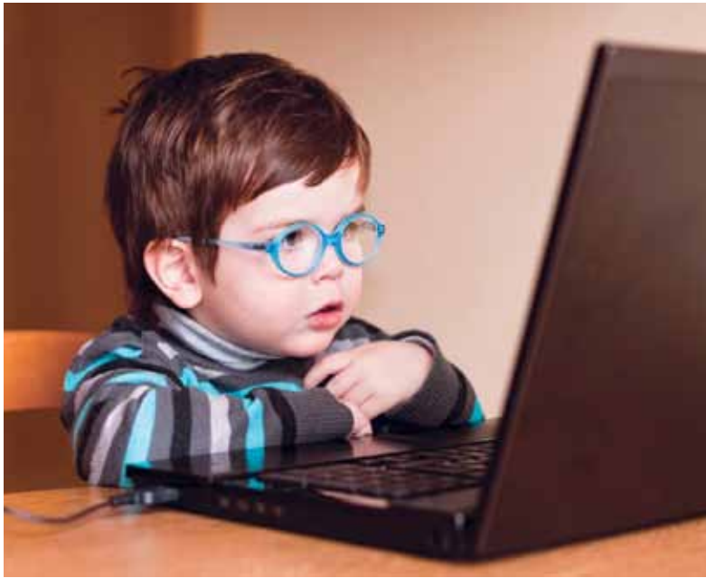
A young child glued to the internet.

take 15, 14 year olds, 16 year olds, and they're glued to a digital system, and they're communicating through digital systems, with all the limitations and the restrictions and the way you have to go through the loops, you're destroying their mind. You're destroying their emotions; you're destroying their personality; you're destroying their minds.