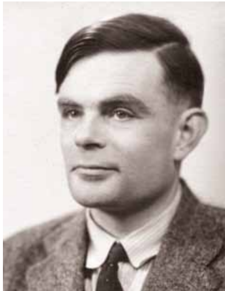
British computer scientist and mathematician Alan Turing (1912-1954).

Now, I won’t go into the craziness of that, but I will say one thing. First of all, the idea that they make him into some kind of a hero who saved—this is how the British saved the world, basically. He comes from a