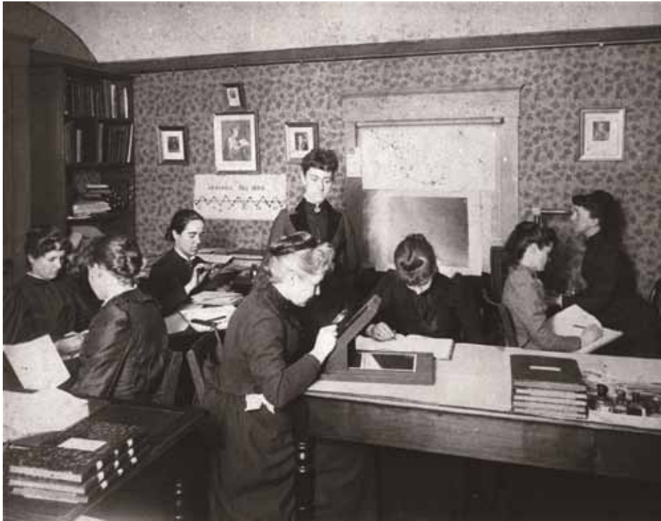
Professor Pickering's "computers" at the Harvard College Observatory, pictured in 1890.

quence, still used today, "Oh, Be A Fine Girl—Kiss Me!" Later in life, as represented in the play, Cannon also became active in the Women's Suffrage movement of the 1920s.