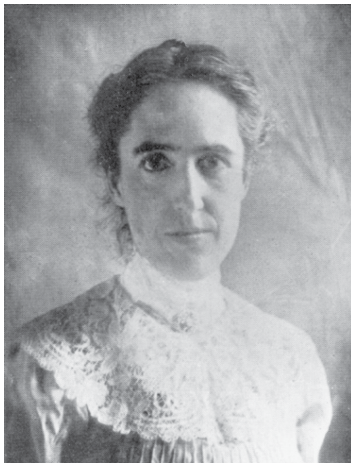
The heroine of Silent Sky, Henrietta Swan Leavitt, 1868-1921. Her discovery led to major changes in our understanding of the Universe.

The theater is the common channel through which the light of wisdom streams down from the thoughtful, better part of society, spreading thence in mild beams throughout the entire state. More correct notions, more refined precepts, purer emotions flow from here into the veins of the people; the clouds of barbarism and gloomy