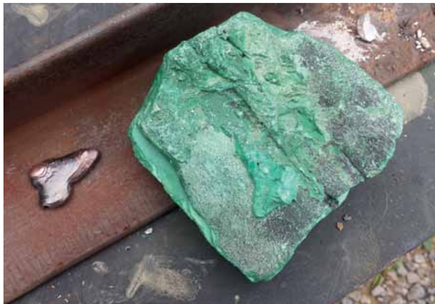
FIGURE 1 Copper and Malachite

Metals and rocks are almost completely opposite physical materials, yet the copper on the left was produced from the rock of malachite on the right.