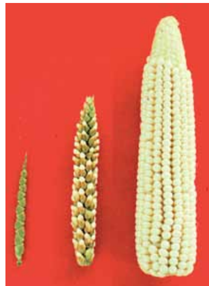
FIGURE 2 Maize-Teosinte

So, economics is based on our ability to create history, to discover new true things, to determine how the universe works, and to change our behavior by using that knowledge to live differently. So 5,000 years ago, human beings first turned rocks into metal ( Figure 1 )—this green rock is called malachite; you can turn it into copper. You can add some tin and create bronze. There weren't any pigs doing this; this was people. This developed a new era in history.