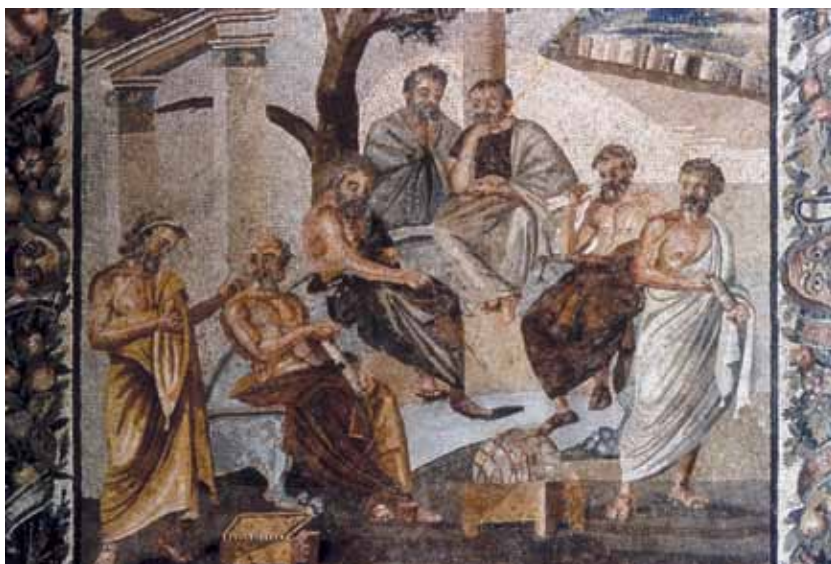
A mosaic of Plato's academy, found in Pompeii.

capture this more poignantly than the mortal wounding of Theaetetus, the great geometer and member of the Academy, in a battle against Persia's allies in 369 BC.