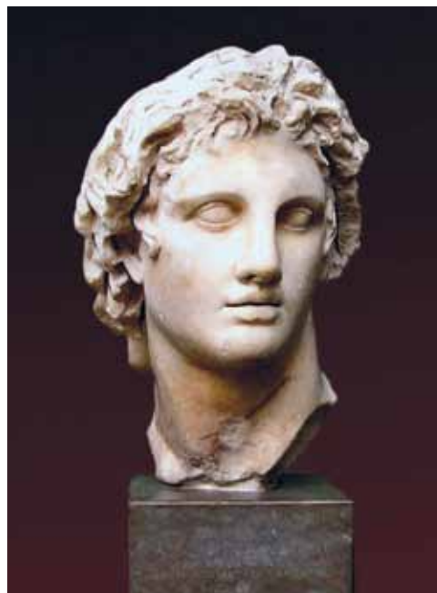
Alexander the Great

like that. Speusippus at that time was ill, and for this reason was unable to stand by Plato. Plato was by now eighty years of age, and at the same time, because of his age, was to some extent losing his memory. So Aristotle devised a plot and set an ambush for him, and began to put questions to him very aggressively and in a way ‘elenctically,’ and was plainly behaving unjustly and unfeelingly. For this reason, Plato left the con-course outside, and walked about inside with his companions. (Cited in Aelian, Varia Historia 3.19)