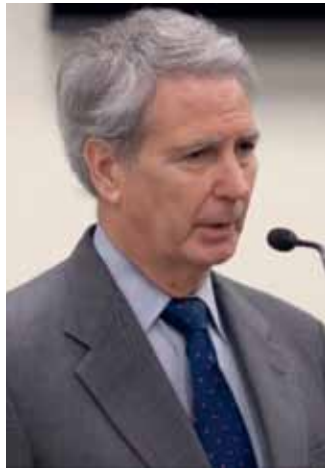
Rep. Walter B. Jones

I have read the 28 pages, and the 28 pages have nothing to do with national security, nothing , or I wouldn't be standing here. It's all about relationships and involvement in 9/11. So for me personally, what is happening today, with the Senate taking the lead—and again, I thank Sen. Rand Paul, he mentioned today that I called him numerous times about getting involved, but we knew this would be a process. We knew it wouldn't happen in 30 days or six months. But the longer we could keep beating the drum, this was a huge drumbeat