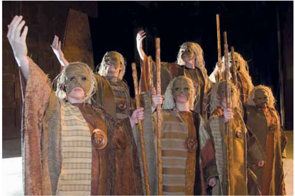
The chorus in a production of Sophocles' tragedy Antigone.

And this is the function of the chorus in tragedy. The chorus itself is not an individual, rather a general conception, but this conception represents itself in a sensuous, powerful mass, which impresses the senses