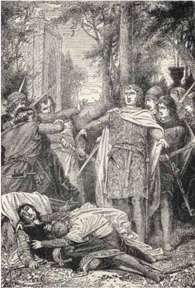
An illustration of Friedrich Schiller's tragedy The Bride of Messina, from Project Gutenberg at the Berlin State Library.

he was before, and it has not been changed in the slightest. Thus, nothing but a pleasant delusion of the moment has been won, which disappears when one awakens.