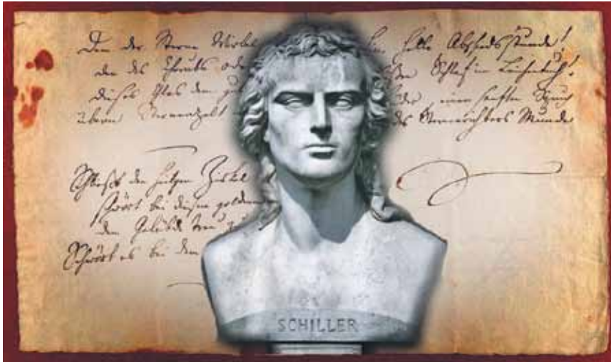
A bust of Friedrich Schiller

setting before publication, and no manuscript exists. 32 Go one year back in time, to age 23.