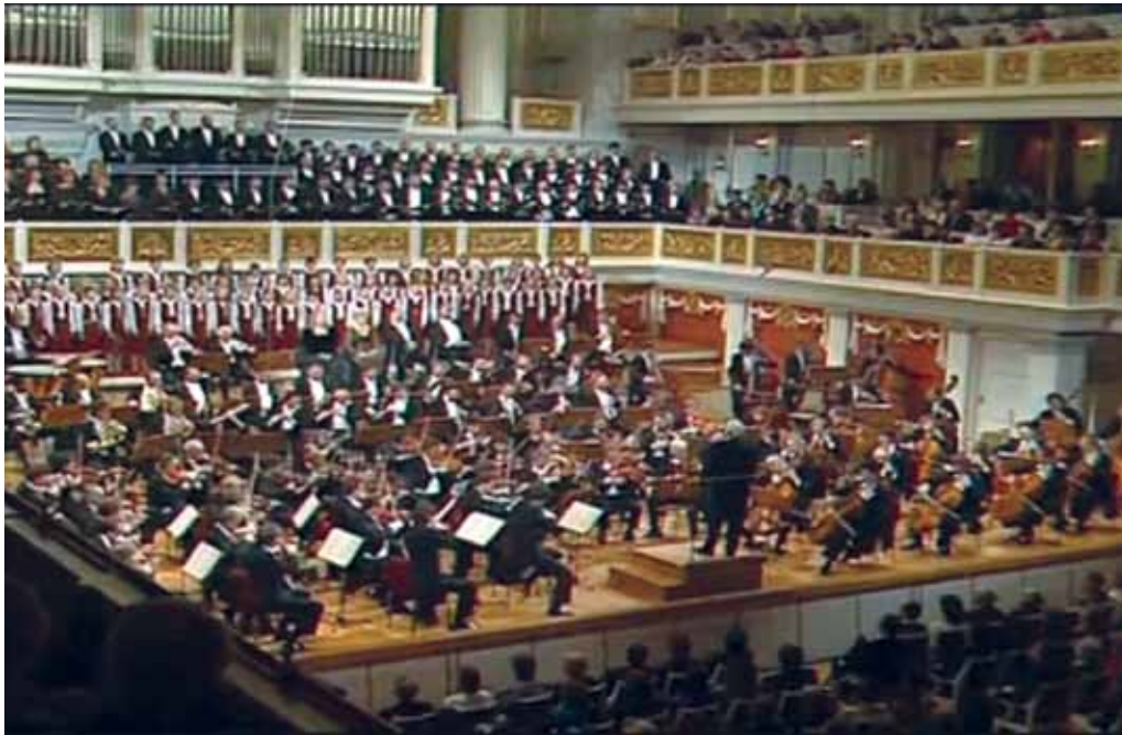
The Christmas Eve 1989 performance of Beethoven's Ninth Symphony, played in the center of Berlin to celebrate the fall of the Berlin Wall.

makes his revolutionary non-linear upward jump—the instrumental recitative from before, is now superseded by the startling entrance of a human voice, in the middle of a symphony! In the transcendental passage mentioned above, the lone baritone, in the same tonal range as the cellos and basses, starting with the beginning notes from the first instrumental recitative, and ending with the same notes as the last instrumental recitative, first rejects the past, and then reaches for the future, through his embrace of the Joy theme, this time, a song with words.