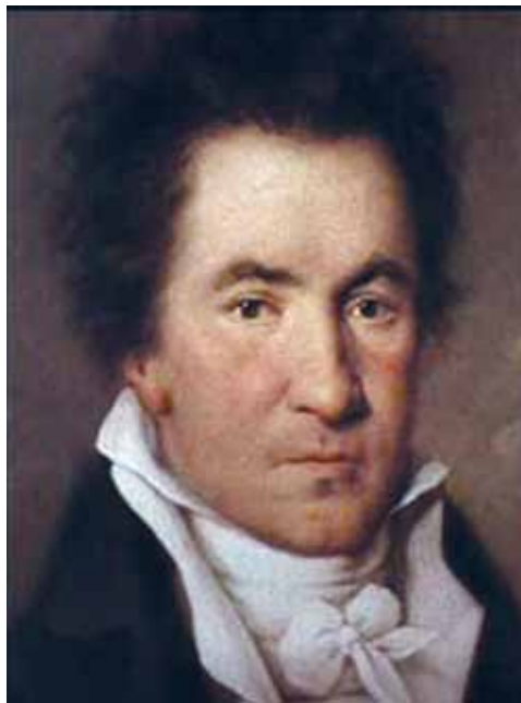
Beethoven as a young man.

Beethoven would hold an Academy—a grand 4-hour-long concert consisting of the premiers of the