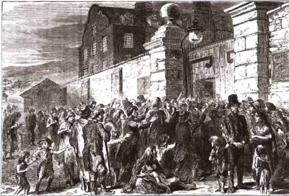
Starving Irish peasants at the gates of a workhouse.

To enforce this, Pitt eventually provoked his own Irish armed revolt. His military repression of the Irish Uprising of 1798 disarmed the Irish Volunteers and introduced large numbers of British troops, to force the 1801 Act of Union which annulled the Irish Constitution. (During the same period, the same policy of the same Pitt and Shelburne also reduced and impoverished Scotland, which had begun to industrialize at the time of the American Revolution.)