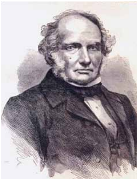
Prime responsibility for starving the Irish people lay with Queen Victoria (r. 1837-1901), shown here in 1887, and her Prime Minister Lord John Russell, who was in office from 1846 to 1852.

Any historian who has studied the subject knows that potatoes (or the lack thereof) did not cause the Irish famine and genocide 170 years ago. The potato blight which struck the harvest in Autumn 1845, had begun in