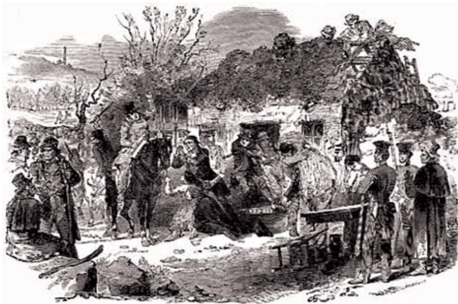
One of many mass evictions carried out by the British during the deepening Irish famine.

nothing about the new problem—the disastrous fact that all seed potatoes had been eaten and there was nothing to plant in 1847: “The moment it came to be understood that the government would supply seed, the painful exertions of private initiative to preserve a stock of seed would be relaxed.”