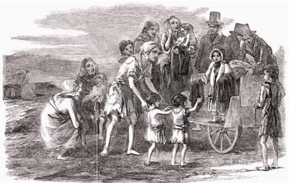
Clothing being distributed during the Irish Potato Famine.

Nor were potatoes the only major produce of Irish agriculture at the time; they were just the only produce which the Irish—75% of whom had become tenants of British landlords—were allowed to eat or to feed to their livestock. The historian Arthur Young had written in 1841 that in the course of two generations to that point, Irish tenant farmers had become slaves in effect: