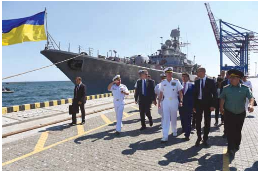
U.S. and Ukrainian officials at the kickoff of NATO's Sea Breeze-2015 maneuver in the Black Sea, September 1, 2015.

For example, you had King Abdullah II of Jordan; you had President el-Sisi of Egypt, who spent three days in Moscow, mostly meeting one on one with President Putin. And they worked a great deal on ideas for how to solve the problem of the Islamic State, and the instability that has not only triggered a crisis throughout the Middle East, but has resulted—along with the crisis in Libya—in waves of refugees seeking survival inside continental Europe; flooding an area that is already in profound economic crisis with a humanitarian crisis of severe proportions.