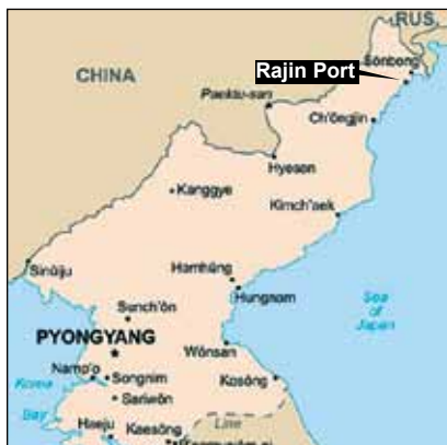
Location of North Korea's ice-free port at Rason, formerly called Rajin-Sonbong.

As for North Korea, although even China has denounced its continued nuclear weapons development program, I would note that the North Koreans have observed what was done to Iraq and Libya after they gave up their nuclear weapons programs to appease the West,—only to