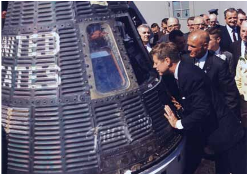
John F. Kennedy Library