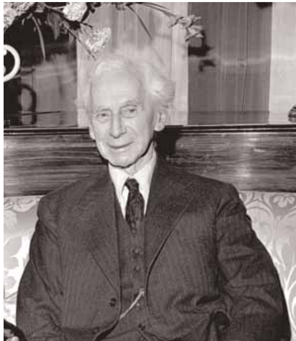
Lord Bertrand Russell

Obama's belief that power lies in killing, was