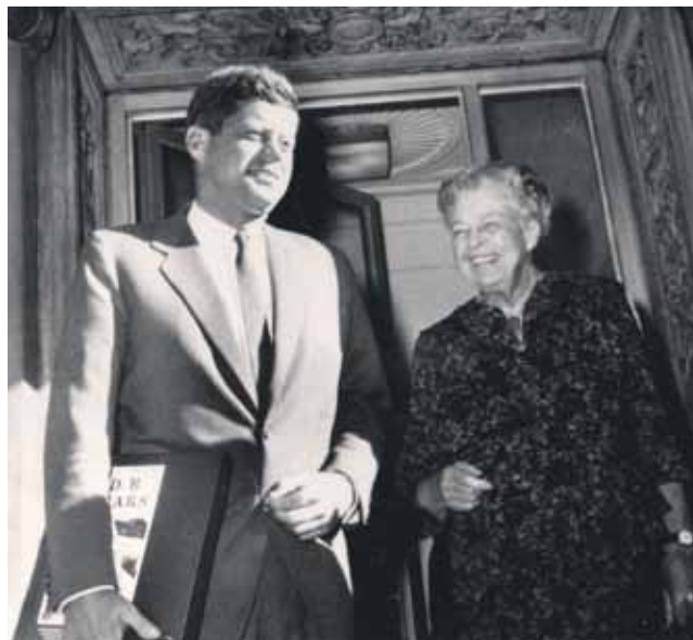
Franklin D. Roosevelt Library

We are now in the process of putting together something which is yet bigger, which is a series of