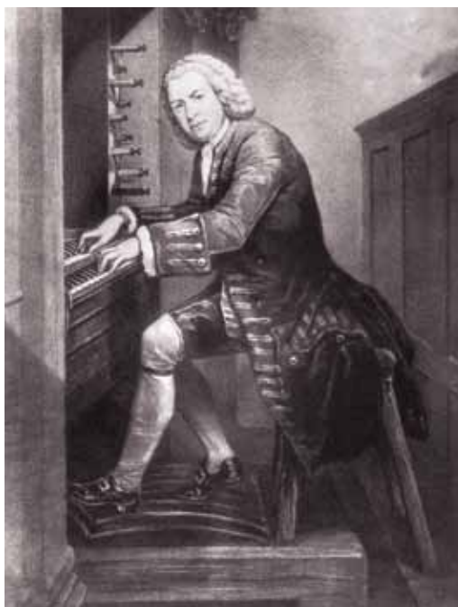
From a print in the British Museum Johann Sebastian Bach (1685-1750), German musician and composer, shown here playing the organ, circa 1725.

Because one of the things about Classical