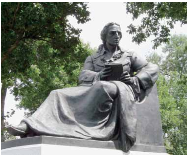
A statue of Friedrich Schiller in Detroit, Michigan.