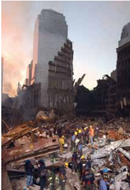
Left: The destroyed World Trade Center Towers after the 9/11/2001 attack.