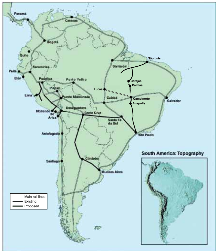
South America: Transcontinental Railroad

The reason the transcontinental rail project did not come up in Xi’s public exchanges with Kuczynski, is that the Peruvian President—lifelong Wall Street banker that he is—is inalterably opposed to the project,