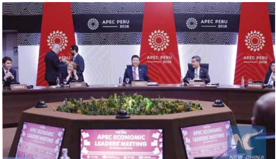
Chinese President Xi Jinping (center) attends the 24th APEC Economic Leaders' Meeting in Lima, Peru, Nov. 20, 2016.