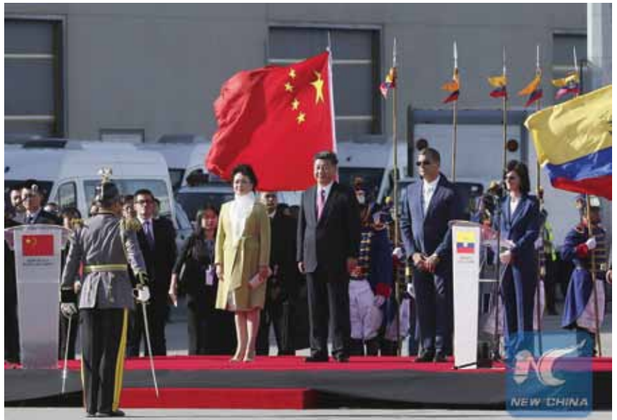
Ecuador President Rafael Correa (second from right) holds a welcoming ceremony for Chinese President (center) at the airport in Quito, Ecuador, Nov. 17, 2016.