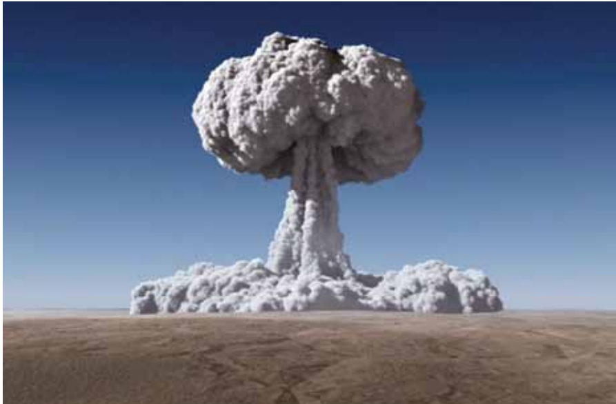
Russell proposed the pre-emptive use of nuclear bombs on the Soviet Union to compel the Soviets to submit to a world government. Here, a nuclear test explosion.

Hiroshima and Nagasaki. This bombing was unnecessary and was done to terrorize the world. Japan was already negotiating a surrender through private channels.