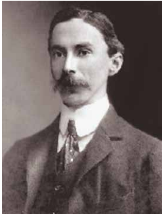
Oligarch Bertrand Russell in 1907. Publication of Principia Mathematica, written jointly with Alfred North Whitehead, began in 1910. He inherited the family earldom in 1931.

What happened to us? Are we that stupid? Are we that uncaring? Are we that depraved? Are we that depressed? Are we that evil that we would launch a nuclear war against our "enemies," Russia and China, if they don't agree to become like us? Emphatically,—yes, we are all of those things. What happened?