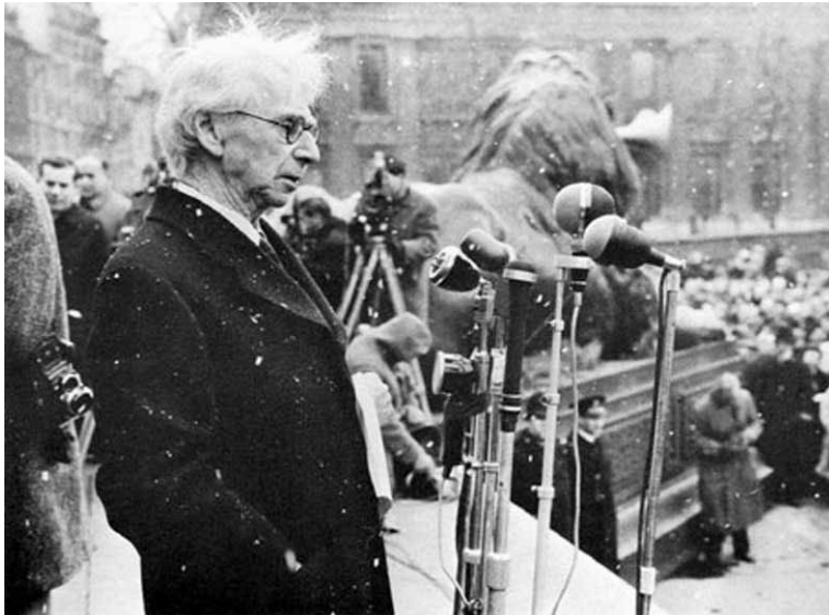
Russell addresses the Campaign for Nuclear Disarmament in Trafalgar Square in 1959. He used the fear of nuclear war to vilify nuclear power and science in general.

played a key role in initiating the actions of Nikita Khrushchov which led to the Cuban missile crisis. The Cuban missile crisis was used to terrorize the world, especially for those born after World War II. Those born after World War II, the “baby boomers,” were at that time children, or young adolescents, who did not have the emotional maturity to deal with this terror. As a result, an indelible imprint of sheer terror has warped the minds and souls of the generation now entering retirement.