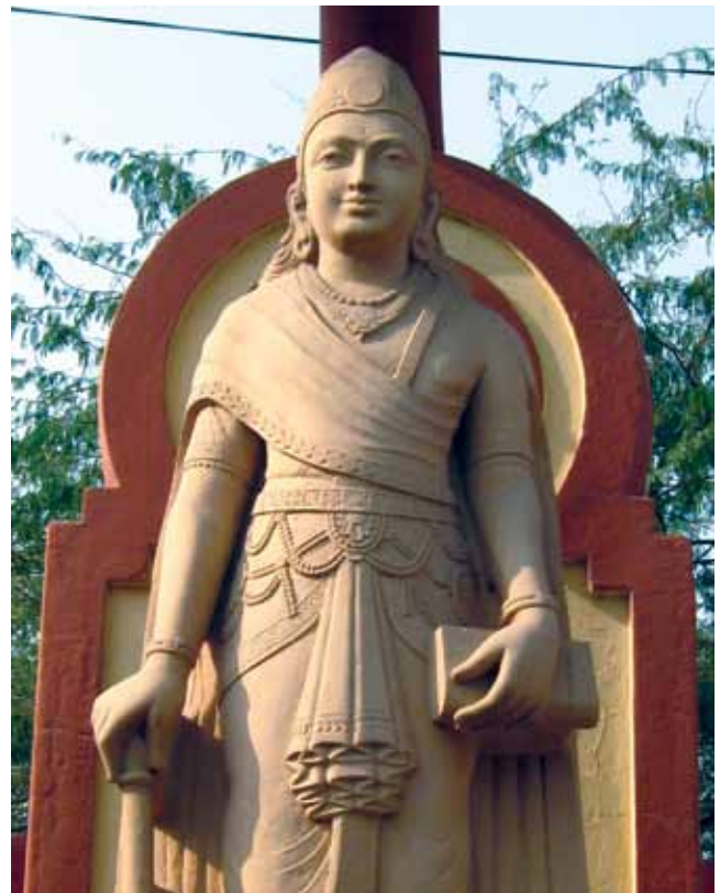
We must combine economic reconstruction with a renaissance of Classical culture and a dialogue of the highest phases of all cultures. Here, a modern statue of Chandragupta Maurya (340-c. 297 BC) at the Laxminarayan Temple in Delhi, India. His rule, renowned for its thriving agriculture, trade, art, and architecture, was followed by more advanced phases of high culture, including especially that of the Gupta Empire, at its zenith from about 240 to 550 AD.

So you have to have a tremendous sense of opti-