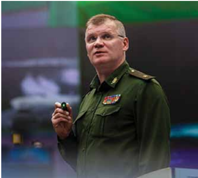
Russian Ministry of Defense