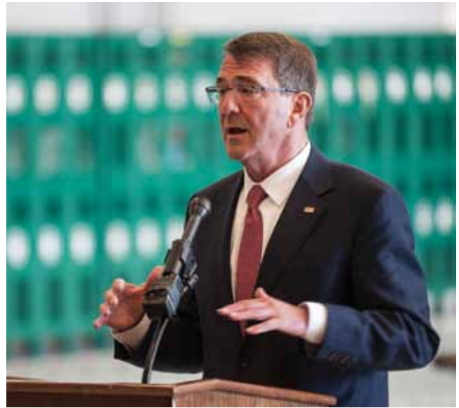
U.S. Secretary of Defense Ashton Carter

On Feb. 1, Global Times , a publication put out by People’s Daily , the newspaper of the Chinese Communist Party, published a lead editorial warning that the United States is preparing for war, nuclear war, against China. It called for China to “accelerate its speed of building up strategic strike capabilities, including a nuclear second-strike capability.”