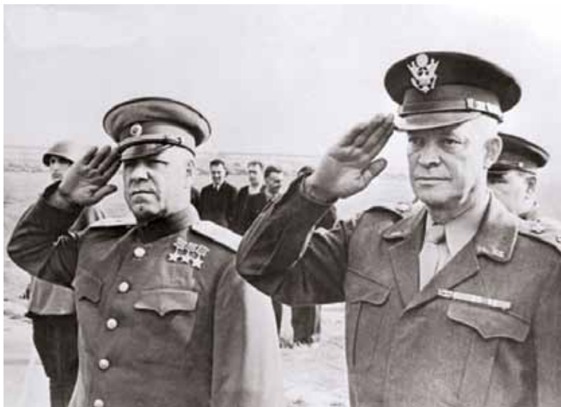
General Georgy Zhukov and General Dwight Eisenhower.

The question is this: There’s things we don’t know, but they are going to happen anyway. But we just have a lack of certainty among some issues, because we’re not in an effective place to take on everything all at the same time. But there’s no question that those of us who are intent on surviving this situation, surviving this period of history, are going to work with us, be-