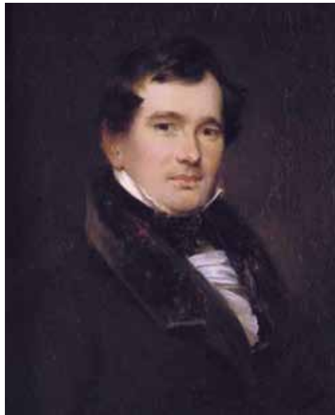
Painted by Charles R. Leslie (1793-1879)