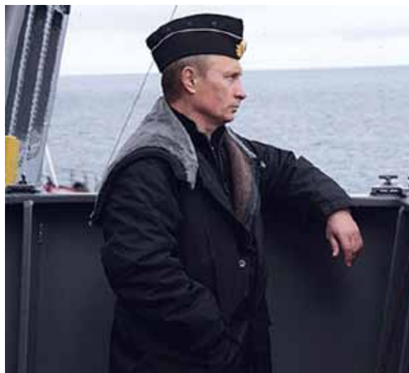
Russia's secret weapon: Vladimir Putin's genius. Putin is pictured here aboard the battlecruiser Pyotr Velikiy during the Northern Fleet exercise in 2005.

But the reality is that it was the genius of Russian President Vladimir Putin—who made the command decision to launch the Syrian operation at a critical moment, totally outflanking the United States and Brit-