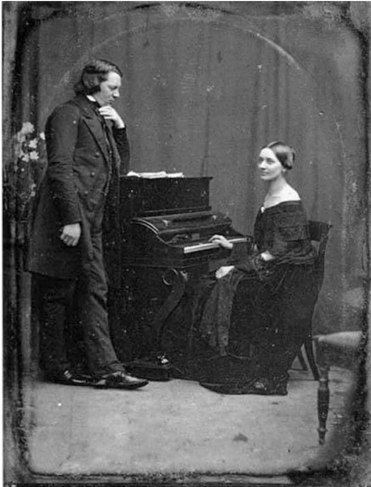
The Schumanns and their extended network of associates were all dedicated to music as the communication of profound ideas and principles.