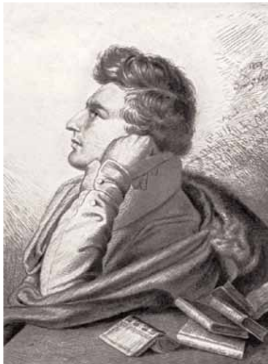
The poet Heinrich Heine composed the lyrics to Dichterliebe .

The poet Heinrich Heine, who composed the lyrics to Dichterliebe , developed himself into a scholar of this mind-set, and in his major work, The History of Religion and Philosophy in Germany , he points out that the so-called “Romantic School” was in fact spawned by the philosopher Immanuel Kant, who argued that true creativity is essentially unknowable, and that humans are necessarily slaves to their own emotions, curbed only by social rules or maxims. In other words, man is essentially a trainable animal.