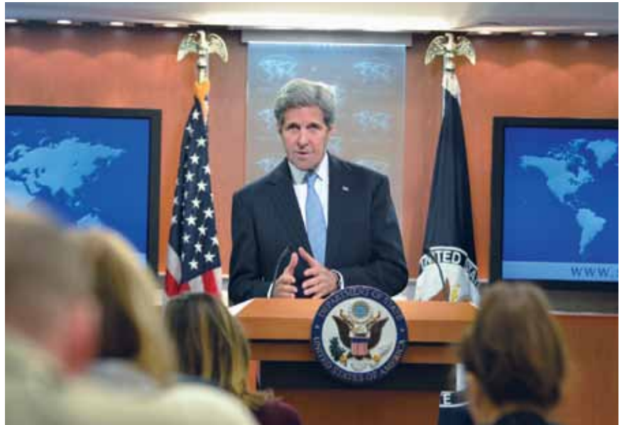
Department of State

In the beginning of the event, Russian President Putin was streamed live into the amphitheater there, and delivered a prayer in which he situated the significance of this concert. He began by saying, “This concert should be a sign of our gratitude, remembrance, and hope.” He