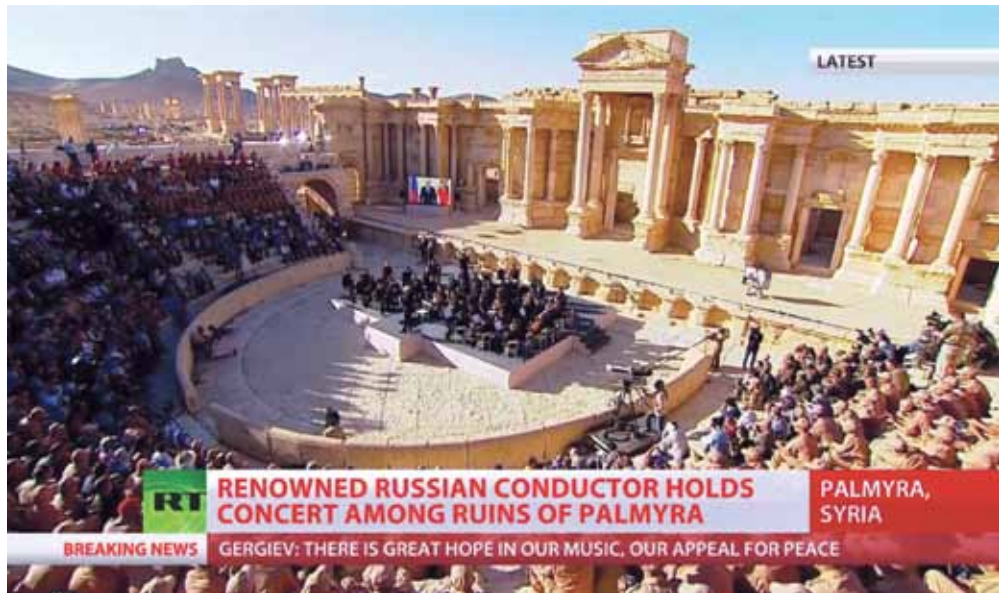
RT livestream coverage

In contradistinction to the treasonous cowardice shown by the leaders and citizens of the United States over the last 15 years, Russian President Vladimir Putin on May 5 organized a Classical music concert in Palmyra, Syria, as a tribute to those who have died in the war against ISIS.