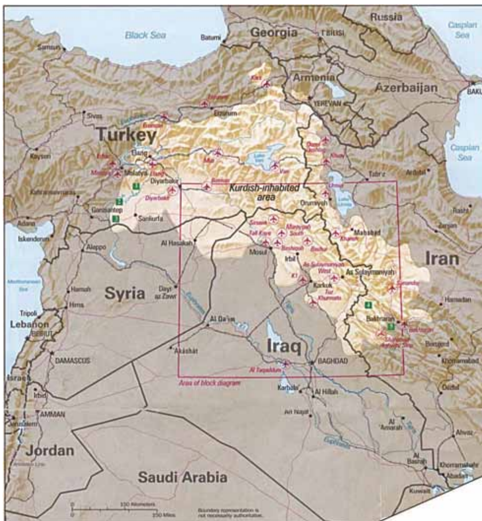
Turkish President Erdogan is threatening to expand Turkey's conflict with the Kurds into Kurdish areas in Syria and Iraq that border Turkey. Areas with Kurdish populations are shown in the map.

Yeni Safak also reported that Turkey is planning to respond militarily against the Democratic Union Party