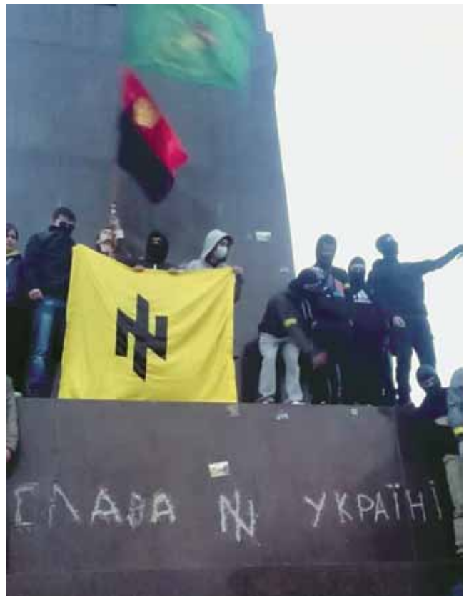
Ukrainian Antifascist Solidarity

So we are really at the edge. I must say I got a very, very eerie feeling when I received reports that Obama, before he went to Hiroshima, not only did not apologize for the U.S. having dropped nuclear bombs on Hiroshima and Nagasaki, for which there was, in reality, no reason. That attack did not save the lives of a million