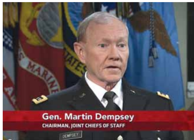
Former Chairman of the Joint Chiefs of Staff, Martin Dempsey, warned many times of the danger of the United States falling into the Thucydides trap.

There is also the same kind of geopolitical intention for regime change against China, which I don't want to elaborate on now; we can possibly do so in the discussion. But what I'm saying is that neither Russia nor China is aggressive. Don't believe these media lies, which are forms of pre-war propaganda. As a matter of fact, the absolute opposite is true. China has initiated a policy which is a war avoidance policy; it is actually the only perspective for overcoming geopolitics which has been put on the table by anyone. In September 2013, when Xi Jinping announced in Kazakhstan the New Silk Road, this was a policy in the tradition of the ancient Silk Road which, 2000 years ago, during the Chinese Han administration, involved an exchange of