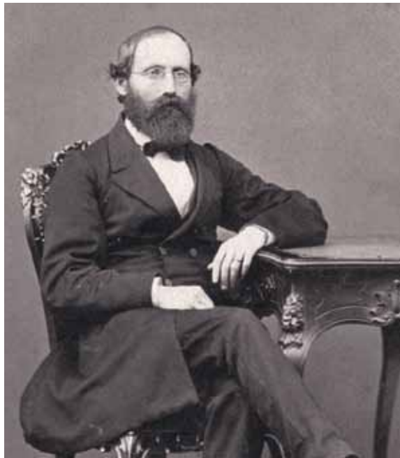
The German scientist and genius, Bernhard Riemann.

Human culture cannot remain dominated by either a monetary metric, or by physical consumption levels. Mankind's total emergence from the physical restraints of poverty (fresh water, electricity, basic infrastructure, etc.) requires a new notion of value, beyond discrete statistical measurements. As German scientist Bernhard Riemann understood, the only metric of value sufficient within a system of non-linear transformations is one which is continuous, i.e. a metric