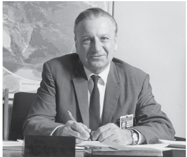
Krafft Ehricke envisioned the tasks for the exploration of our planetary system.

Yet, however impressive these projects are, this method of linear listing of projects remains insufficient to grasp the metric of growth now developing in Eurasia. They are too easily dismissed as simply infrastructure projects, though the scope of area (nearly 50% of