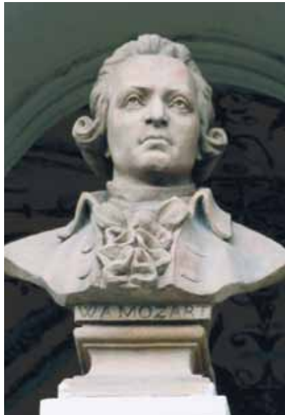
A bust of Wolfgang Amadeus Mozart, in Bratislava, Slovakia.