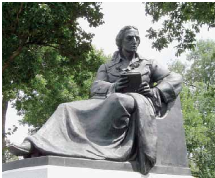
A statue of Friedrich Schiller in Detroit, Michigan.