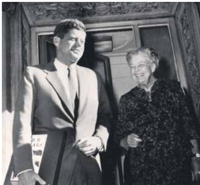
Franklin D. Roosevelt Library

We are now in the process of putting together something which is yet bigger, which is a series of