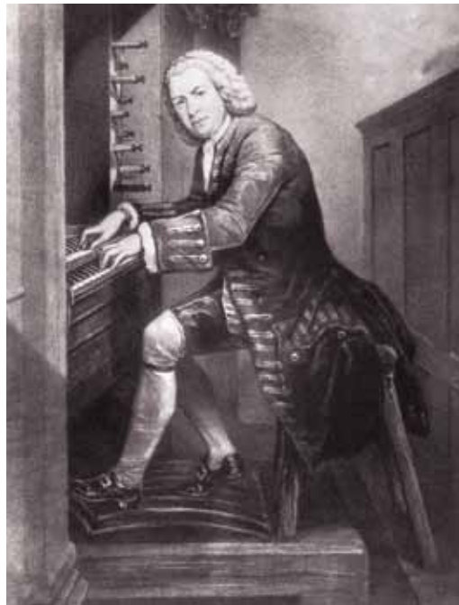
Johann Sebastian Bach (1685-1750), German musician and composer, shown here playing the organ, circa 1725.

Because one of the things about Classical