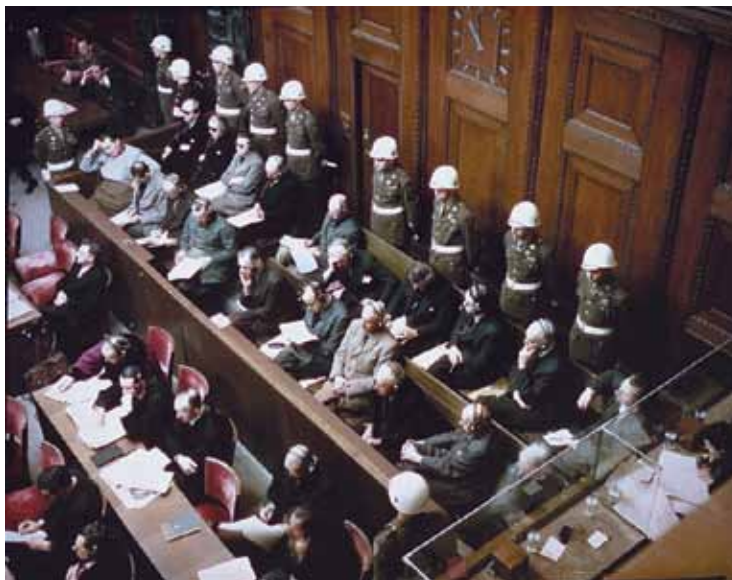
Defendants at the trial at Nuremberg.

The same Obama who promised in 2009 that he would work to get a nuclear-free world, has committed $1 trillion for the modernization of all U.S. nuclear arsenals, such as the B61-12 warhead, of which there are probably 200 stationed in European countries. The idea is that these modernized tactical nuclear weapons are more usable, because you can put them on stealth bombers, and break through the air defenses of your opponent. So that's the case with the long-range stand-off weapons, the LRSW.