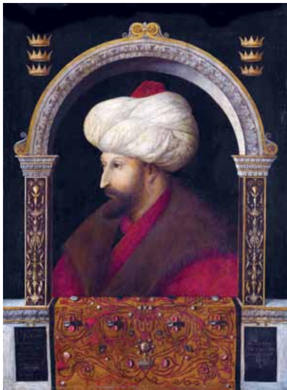
Portrait of Great Sultan Mehmet II, 1480. portrait, Gentile Bellini

To save mankind, we need a completely different level of thinking and I would like, for this purpose, to turn to Nicholas of Cusa, who was probably the most