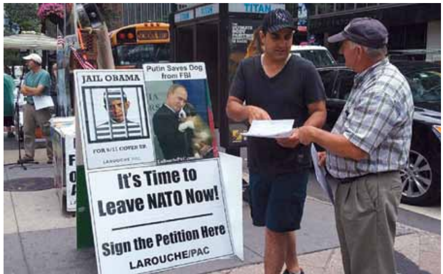
LaRouche PAC anti-NATO organizing in New York City in 2016.

Look at what has happened since the announcement of the New Silk Road: In less than three years, this new system has developed an enormous dynamic. Now 70