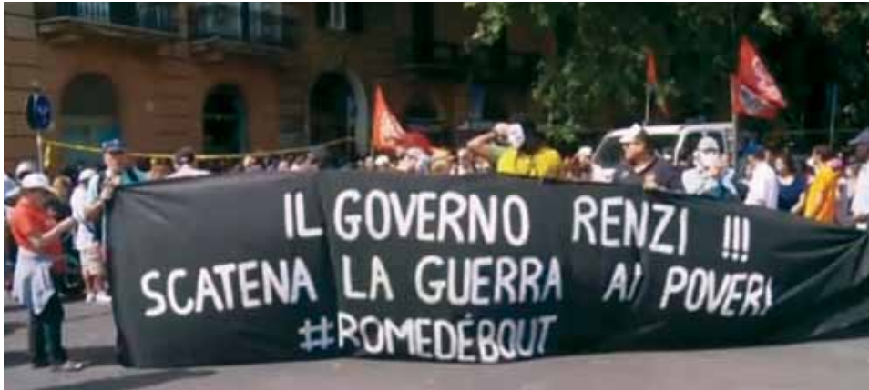
Press TV news video as seen on youtube

Anti-austerity protests in Italy send a message to Prime Minister Matteo Renzi.