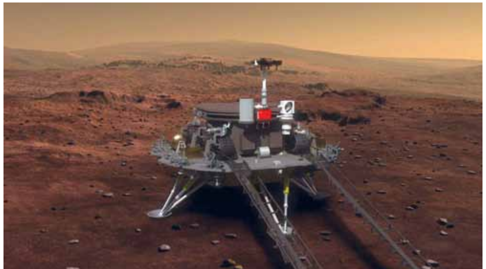
An illustration of China’s Mars lander and rover released Aug. 23, 2016 by the Chinese State Administration of Science, Technology, and Industry for National Defense.

In recent discussions that Lyndon and Helga LaRouche have conducted with associates, Mrs. LaRouche has made it clear that, at the present moment, there is no sign from either the European Union or the United States