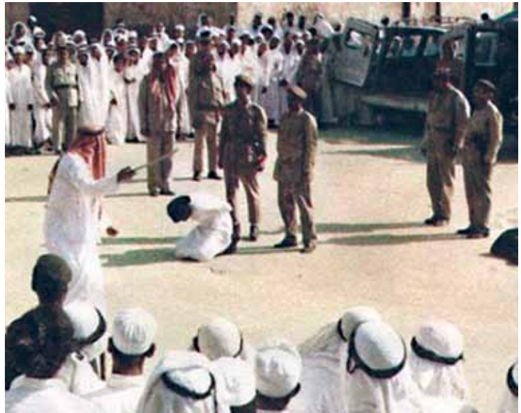
Saudi Arabia TV

Islam has become a good business for manipulation. Very good business for manipulation, very good business. Everybody makes business out of Islam very cheaply, and we will try to explain why. It's not about